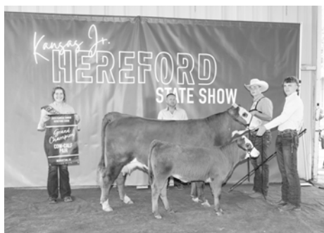
Champion Cow/Calf pair Cole Dieball, KS MCC D56 Ladysport 2203 Feb 6 heifer calf by Cuda 2060