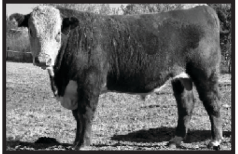
FH 147E Rewind 313L BW 86 WW 840 YW 1195