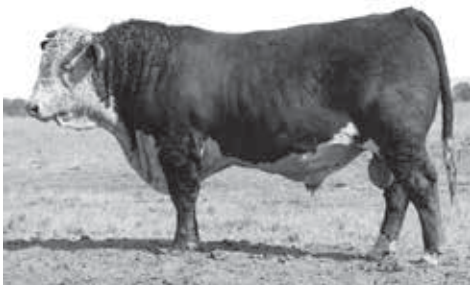
LOT 172 CED .2 BW 3.0 WW 72YW 113 M&G 77 REA .68 MARB .35 BMI 481 CHB 154

MONDAY JANUARY 20, 2025 12:30 PM (MST) ❖ OSHKOSH NE