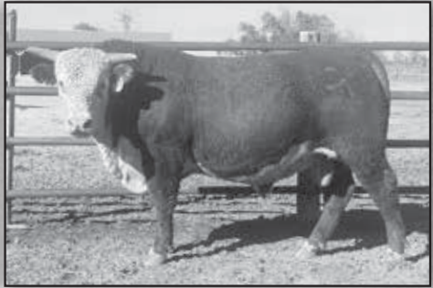
CO L1 Domino 314L

Reg. # 44483922 • Sire: B&B L1 Domino 770 BW 3.9 WW 53 YW 94 MM 36 MG 62