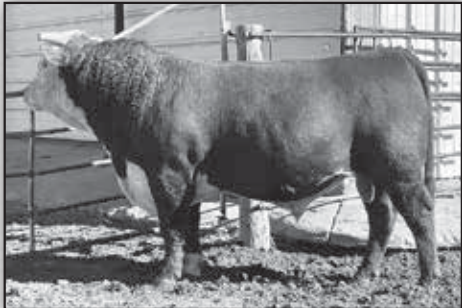
JA L1 Domino 3601L

Reg. # 44461076 • Sire: FS ADVANCE 0079H BW 2.8 WW 64 YW 108 MM 31 MG 63