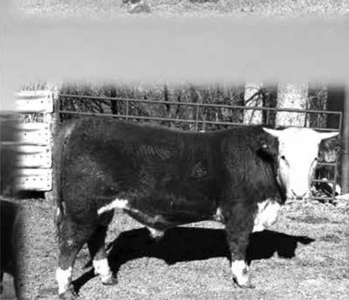
36 Ribstone Lad 439 (44569230)