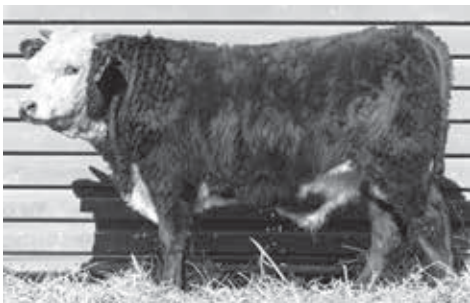
LOT 243 CED .9 BW 4.0 WW 69YW 103 M&G 69 REA .79 MARB .25 BMI 469 CHB 161

JOE VAN NEWKIRK 308-778-6049 KOLBY VAN NEWKIRK 308-778-6230 MATT COVER 308-458-7455