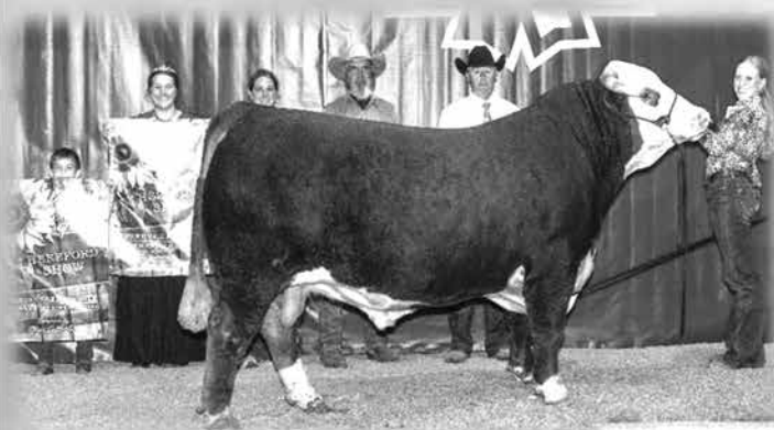
G 83G Draftman 2135 (44361802)