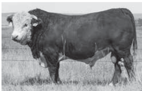
LOT 157 CED 2.1 BW 2.9 WW 66YW 98 M&G 62 REA .55 MARB .43 BMI 474 CHB 157