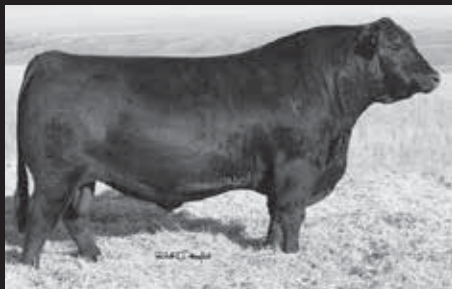
Selling sons of EXAR Grenade 9152B