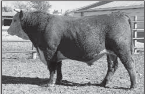
JA L1 Domino 3600L

Reg. # 44471891 • Sire: CL 1 Domino 6163D BW 1.5 WW 57 YW 81 MM 31 MG 59