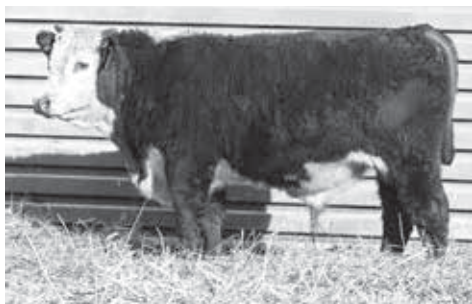
LOT 214 CED 4.3 BW 2.6 WW 71 YW 104 M&G 72 REA .43 MARB .36 BMI 401 CHB 141