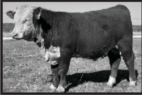
FH 101 Rewind 307L BW 80 WW 685 YW 1049

Developed for the Commercial Rancher - Powerfull, rugged and ready to work in your herd.