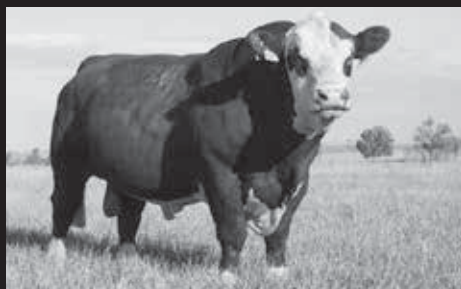
Selling sons of Birdwell Wall Street 0588ET