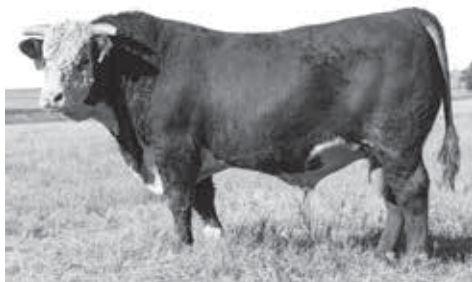
LOT 70 CED 2.6 BW 2.9 WW 67YW 118 M&G 78 REA .75 MARB .39 BMI 456 CHB 173