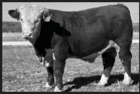
FH 805 Cal 322L BW 91 WW785 YW 1146