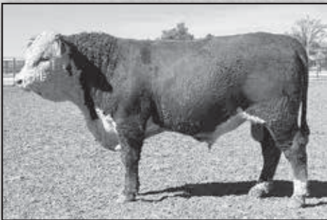
B&B L1 Domino 374

Reg. # 44483922 • Sire: B&B L1 Domino 770 BW 3.9 WW 53 YW 94 MM 36 MG 62