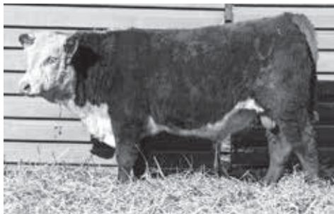
LOT 230 CED 6.0 BW 1.6 WW 74YW 109 M&G 74 REA .23 MARB .54 BMI 402 CHB 159