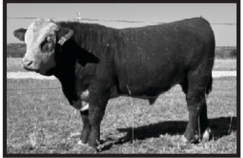
FH 147E Rewind 326L BW 81 WW 725 YW 1055