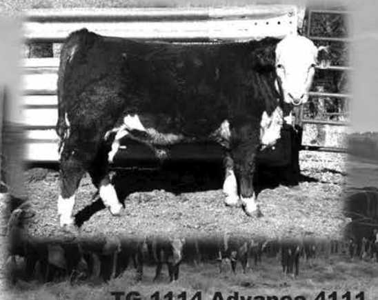
TG 1114 Advance 4111 (44569006)