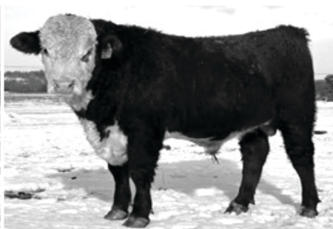
Lot 323 EPD'S: BW 0.8 WW 54 YW 86 M 29 BW 82 WW 660 YW 1042 SC 37 FS 5.9