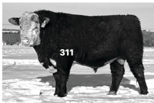
Lot 311 EPD's: BW 0.0 WW 58 YW 94 M 32 BW 78 WW 785 YW 1100 SC 36 WR 104 FS 5.6