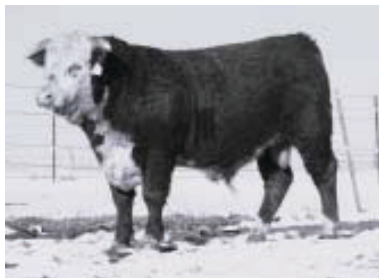
-G 314 DOMINO 341

Two Year Olds, Fall Yearlings and Spring Yearlings