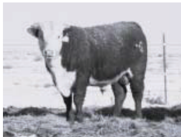
-G 9164 DOMINO 360

Two Year Old Reg. # 44490806 BW 82 WW 706