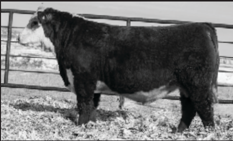
SH/DD KATIE'S WALL STREET M014