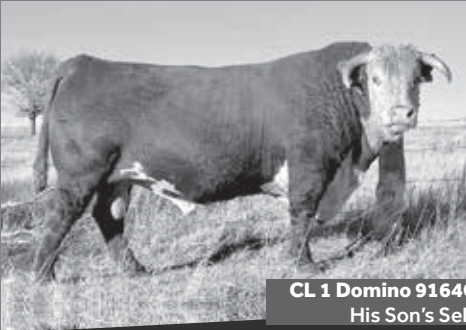
CL 1 Domino 9164G His Son's Sell!

1 PM at the ranch SATURDAY APRIL 12, 2025 Lucas, Kansas