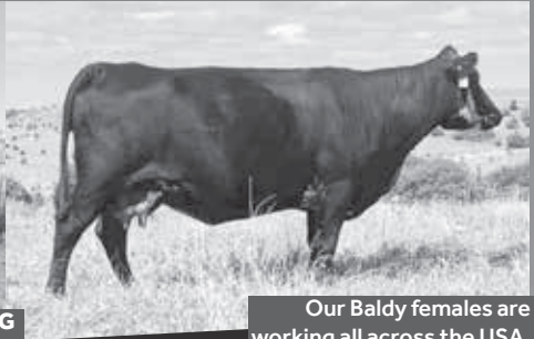
Our Baldy females are working all across the USA.

40 2 Year Old Hereford, Angus, and F1 Black Baldy Bulls