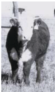
-G 9164 DOMINO 406

Fall Yearling Reg. # 44536467 BW 75 WW 690