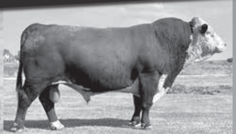
GM L1 5110 700 His Black Baldy Son's and Daughter's Sell!

Please join us April 12th at the ranch for the opportunity to purchase from a maternal first program. Our bulls and females are backed by generations of Meitler maternal cattle. Our longstanding program is simply based on the mother cow. Maternal, feminine, good uddered, docile, long-lasting cows. Videos will be available at DVAuction.com .