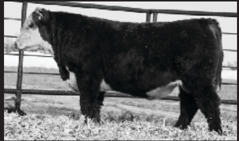
SH LONG HAUL M039