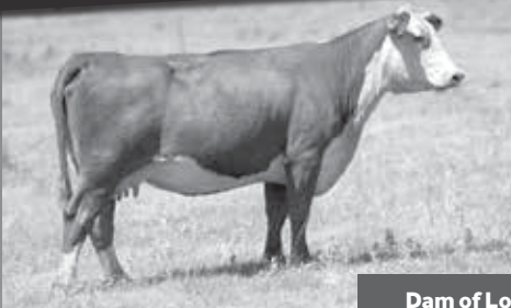
Dam of Lot 1

200 Commercial Black Baldy Females. Including Heifer Pairs, Fall Bred Heifers, & Open Replacement Heifers.