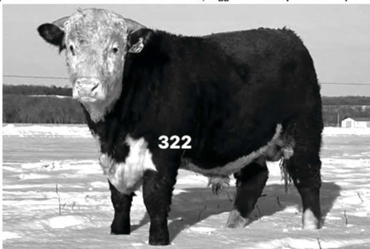
Lot 322 EPD's: BW 4.0 WW 59 YW 98 M 30 BW 91 WW 785 YW 1146 SC 38 WR 107 FS 6.1

Developed for the Commercial Rancher - Powerful, rugged and ready to work in your herd